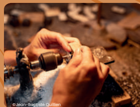
Musée de la Nacre et de la Tableterie