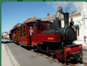
Locomotive 030 Decauville - Appeva