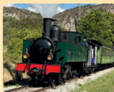
Locomotive 230 Bretonne - GECP