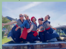
Z'A Crew Pin'up

Show and taster session in a retro, musical atmosphere.