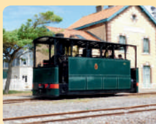
Locomotive 030 bicolor HL 303 - ASV