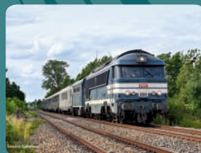
Diesel A1A A1A 68540 - AAATV