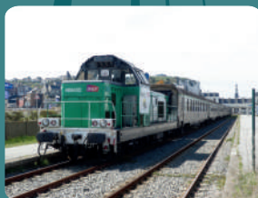
Diesel BB 69432 - MFPN