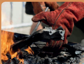
Association “Les Fers Savoirs”