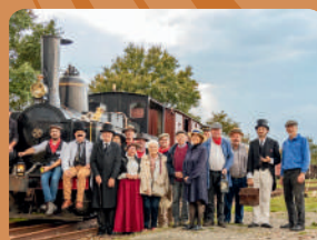
Fancy dress parade