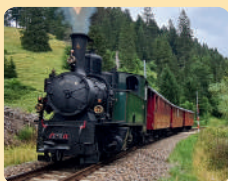
Locomotive G ¼ n°14 baptisée Moidiliana La Traction