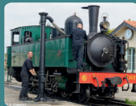
Locomotive 230 Fives-Lille N° E 332 - CFBS