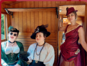
Fancy dress parade