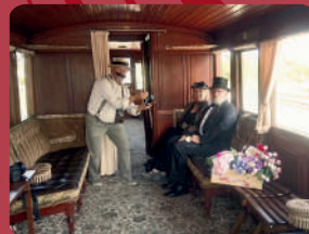
1889 Salon Car