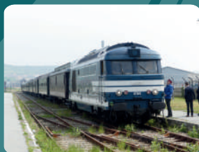
Diesel BB 67400 - PVC